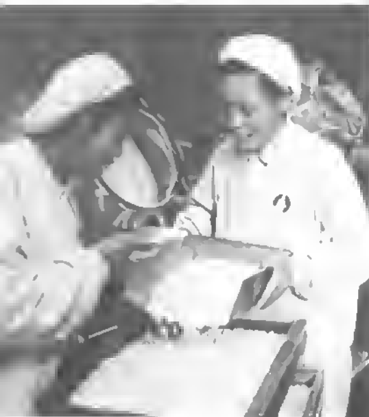
Inexpensive medicines for the rural areas. In the Peking Pharmaceutical Plant.

Guided by Chairman Mao's policies, particularly "maintaining independence and keeping the initiative in our own hands and relying on our own efforts", all production and scientific research in China has made big headway. The pharmaceutical industry has been an integrated part of this rapid advance. As the variety of medicines increased and quality im-